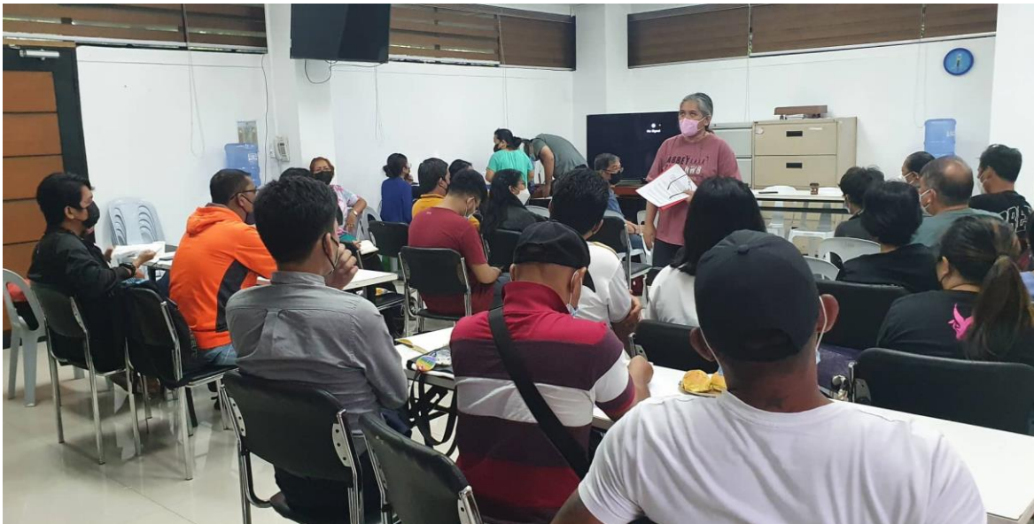
Figure 3. IOHSAD listens to workers' reports on the urgent OSH issues they face at work and if OSH Committees are present in their workplaces