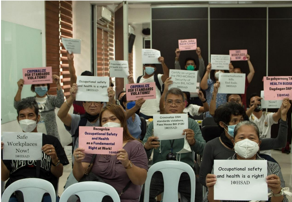
Figure 1. Workers hold signs to show their OSH demands

Institute for Occupational Health and Safety Development (IOHSAD-Philippines) in partnership with the Developing World Outreach Initiative and the Maquiladora Health and Safety Network