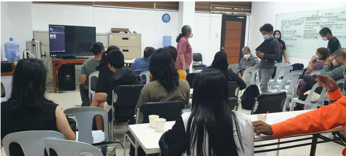
Figure 4 A pedicab driver, member of the informal sector, shares the health and safety issues they face at work -- air pollution, absence of clean and safe terminals and more. They plan to build OSH committees in their organization and push for OSH demands