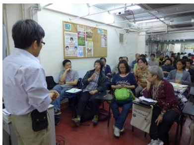
Union leaders sharing their OHS problems. (Hong Kong)

National AIHA and the MHSSN have both renewed their matching grants for DWOI’s Asian OHS training project for calendar year 2013. NCS members who would like to contribute to this effort can make tax-deductible donations on behalf of DWOI to “New Ways to Work,” PO Box 124, Berkeley, CA 94701.