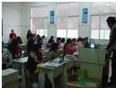
Occupational health & safety law training. (China)