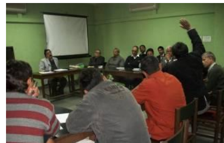
Legal workshop for mine workers. (India)